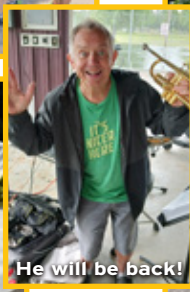
He will be back!