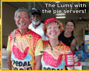
The Lums with the pie servers!