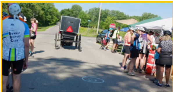
Rush hour at the burrito stop!