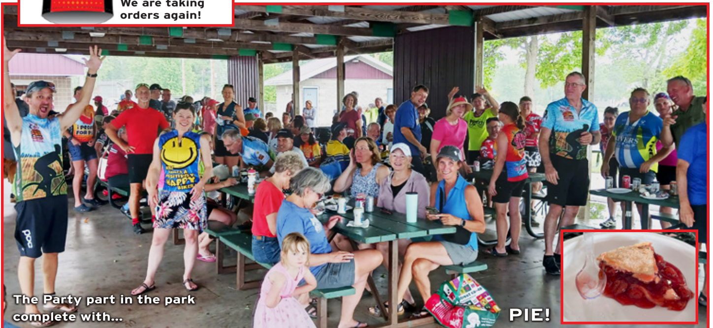
The Party part in the park complete with...