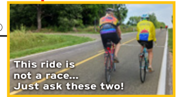
This ride is not a race... Just ask these two!