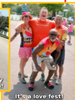
It's a love fest!