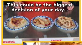
This could be the biggest decision of your day...