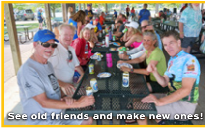
See old friends and make new ones!