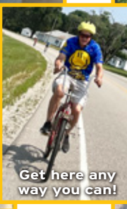
Get here any way you can!