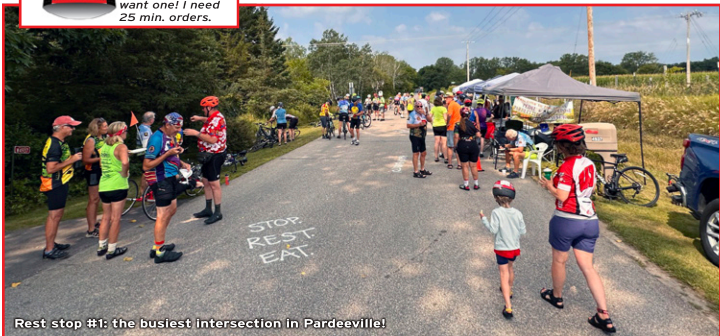
Rest stop #1: the busiest intersection in Pardeeville!

If you pre-register , (meaning we receive your entry on or before July 15th) you get all of the above for a mere $45 (Children under 12 years old in buggers or trail-a-bikes/tandems are free.) We do NOT recommend children ride this on their own bikes unless they are VERY experienced riding on ROADS). This is a (tax deductible) donation to the NATIONAL MULTIPLE SCLEROSIS SOCIETY. Late (after July 15th) and day of Registration donation is $50. Please make checks payable to the National MS Society, Wisconsin Chapter.