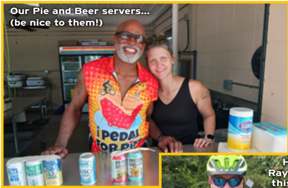
Our Pie and Beer servers... (be nice to them!)