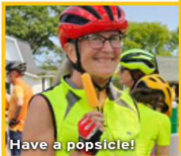
Have a popsicle!