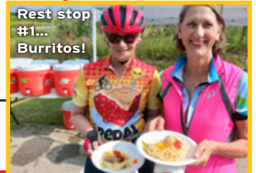
Rest stop #1... Burritos!